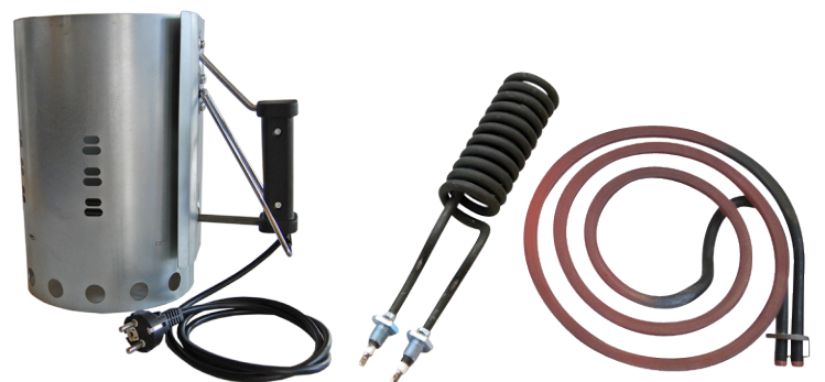
Example of product design